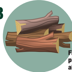
Firewood – larger, dry pieces of wood up to about 6-8" around.